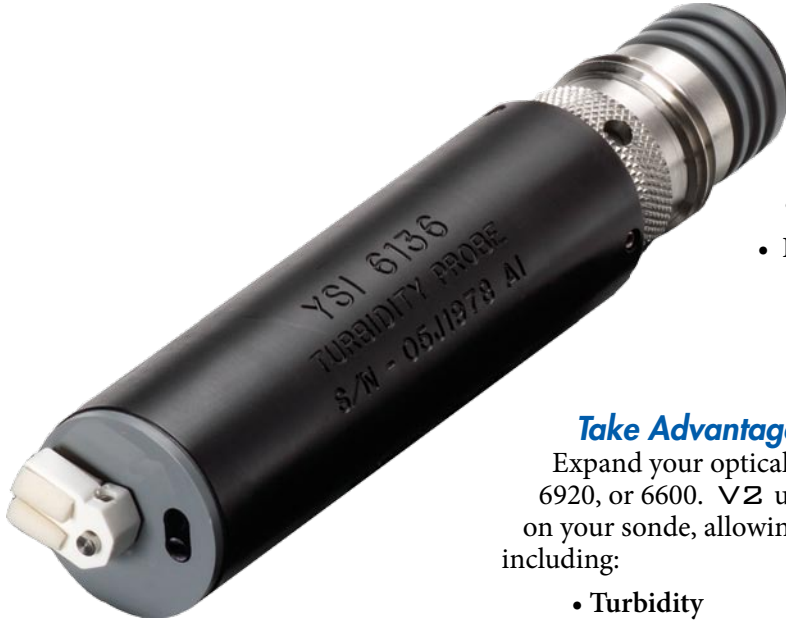
YSI 6136 Optical Turbidity Sensor

The 6136 is a fouling-resistant, wiped sensor designed to seamlessly integrate – using no external interface hardware – with all YSI sondes that contain an optical port. It provides accurate, in situ measurement of turbidity in fresh, brackish, and sea water, and features an improved mechanical self-wiping capability for long-term monitoring, which helps ensure proper turbidity measurements.